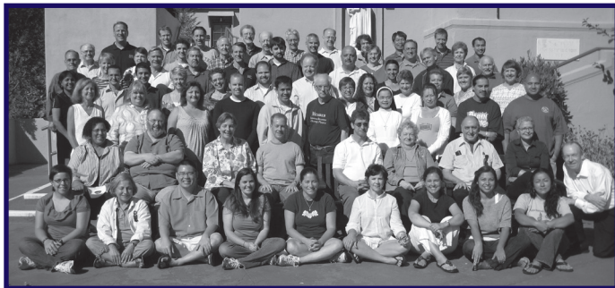
Lay and Jesuit partners in ministry gathered at El Retiro for a five-day Ignatian retreat in June, 2010.

Each day of our silent retreat included a thematic presentation in the morning, a conversation on some aspect of Ignatian prayer in the afternoon, and Eucharist celebrated together. Morning prayer and a variety of evening prayer services rounded out the communal aspect of the days. The presenters and presiders came from a wide range of our ministries—and other Catholic ministries, as well—providing a rich breadth of