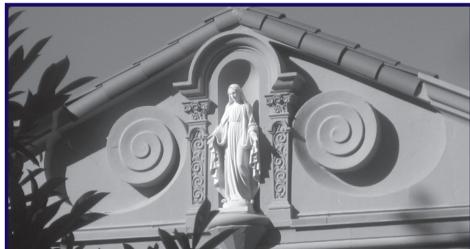
Our Lady graces the Pereira pediment.