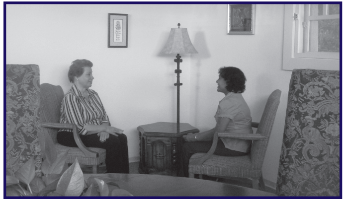
Our newest setting for spiritual direction

When St. Francis Hall was still home to the Wellman family, they enjoyed a billiard room at the north end and on a lower level. The Jesuits promptly expanded this room to provide El Retiro's first chapel, reversing the expansion once Rossi Chapel was completed. Decades of the room's disuse and underuse followed. Some simple renovations have now provided