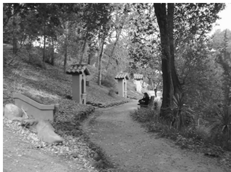
Reflection trail, on the way to the top of the property