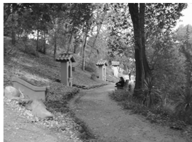
Way of the Cross and meditation path to the top of the property.