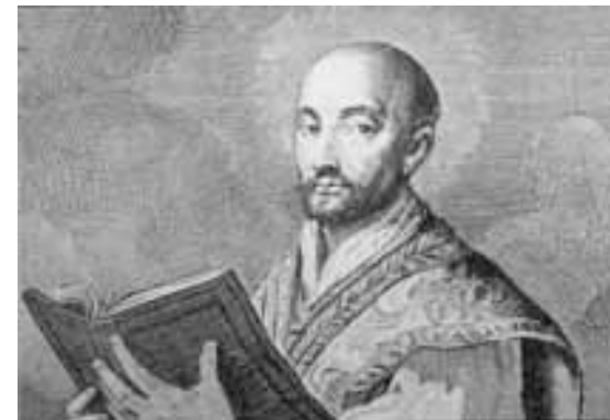
St. Ignatius of Loyola 1491-1556