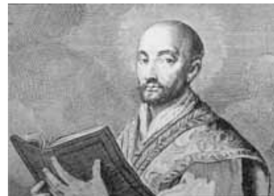
St. Ignatius of Loyola 1491-1556